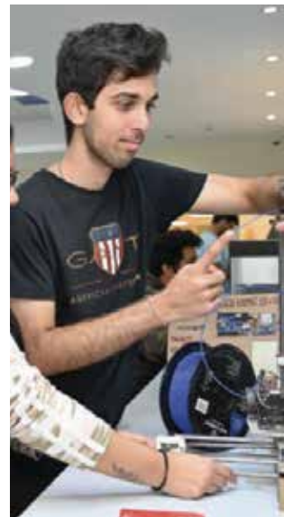
24X7 CREATIVE LAB