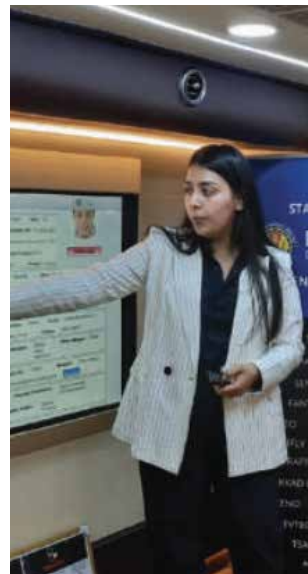
PRESENTING AT INNOVATION HUB