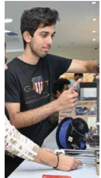
24X7 CREATIVE LAB