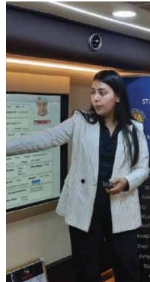
PRESENTING AT INNOVATION HUB