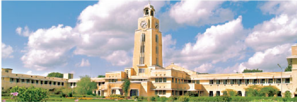
BITS Pilani, Pilani Campus