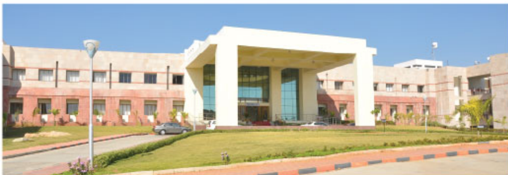
BITS Pilani, Hyderabad Campus