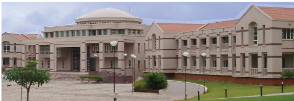
BITS Pilani, K.K. Birla Goa Campus