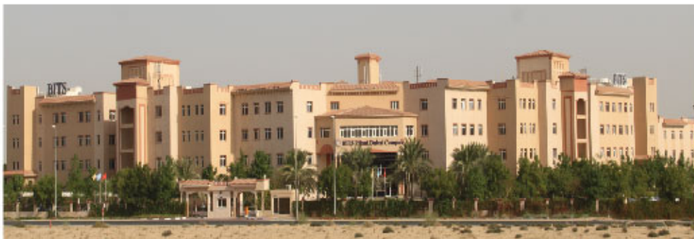
BITS Pilani, Dubai Campus